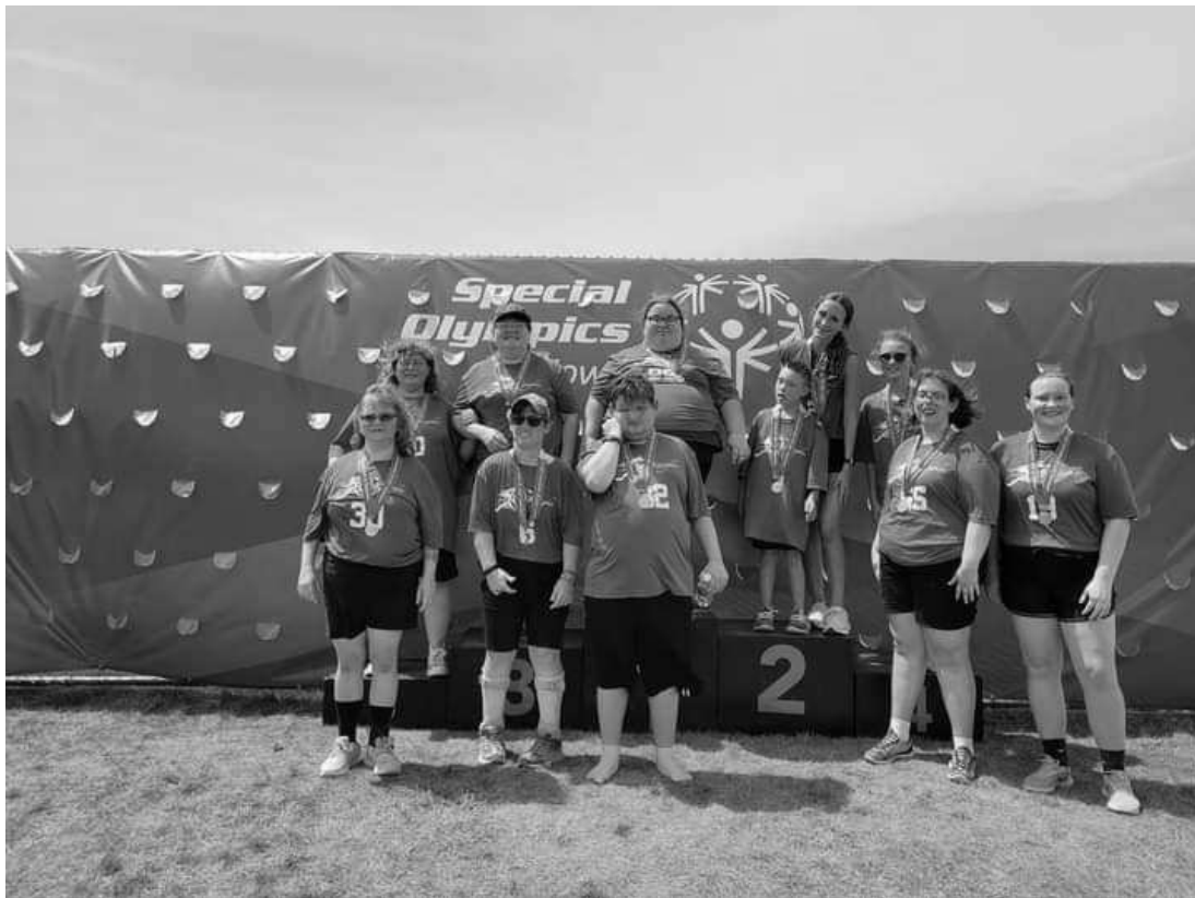
The Runaround Sue's softball team pictured above received a gold medal at State! Below the Da Do Ron Ron's also received a silver medal at State!